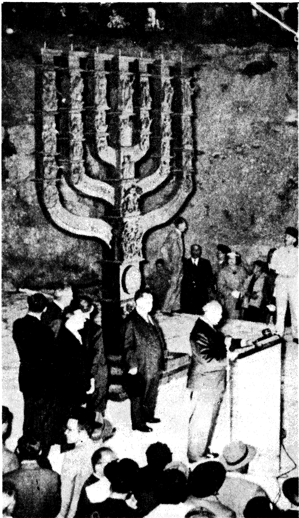
The dream realized: installation ceremony for a huge menorah presented to the newly formed Israeli government by Britain.

Regeneration," Churchill concluded with a personal appeal to Montefiore as the "most likely to take the head in such a glorious struggle for national existence."