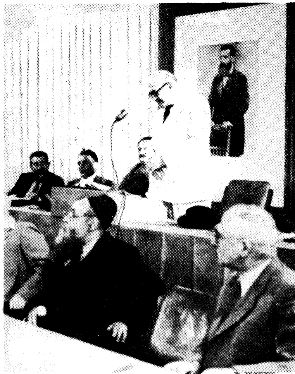
Zionist leader Chaim Weizmann addresses the Israeli Knesset, as its first president. Like Theodore Herzl, whose portrait hangs behind him, Weizmann concurred with the most vicious anti-Semites. Europe’s Jews “must meet their fate,” he said in 1937. “Only a branch will survive. They must accept it.”

Given that Benjamin Disraeli’s novels like Coningsby (1844) and Tancred (1847) were proclaiming the superiority of the Aryan-Semitic “race,” it is obvious where such “ideas” originated. Oligarchist Count de Gobineau’s Essay (1853), for example, had the following