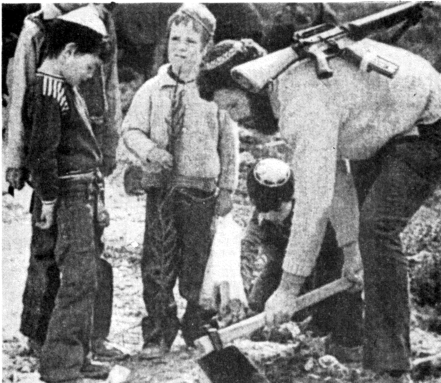
A tree is planted in memory of Masada

The Zealots, a terrorist organization, arose to provoke a bloodbath in Palestine. From every piece of evidence, the Zealots were a direct creation of the Egyptian Isis cult