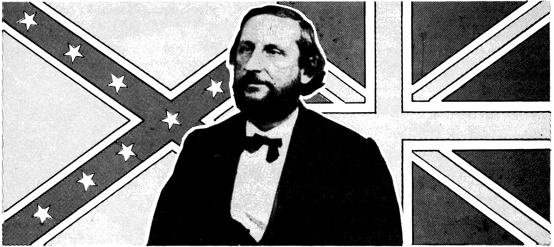
Judah Benjamin, Confederate leader, controller of B'nai B'rith, funder of the KKK

trol." An indication of the source of his messianic zeal is that Sabbatai's father had been for years in contact with certain British merchants seeking to break open the Turkish Empire's control over the Near East.