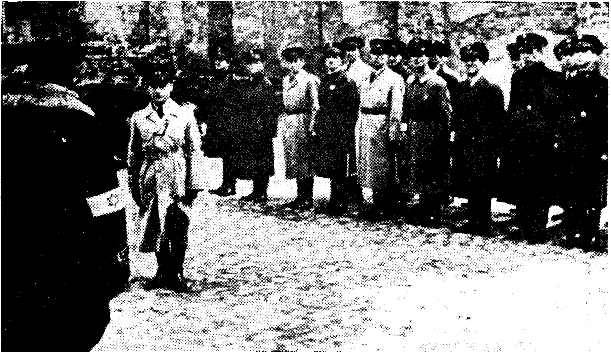
Jewish police in the Warsaw Ghetto report to their Nazi commanders.

than a “national home in Palestine.” Calling the Balfour Declaration the “rebirth of a nation,” Cecil, through the British Foreign Office, put out an official statement denouncing as “palpably false” the argument that Jews were primarily a religious group, and not a nation.