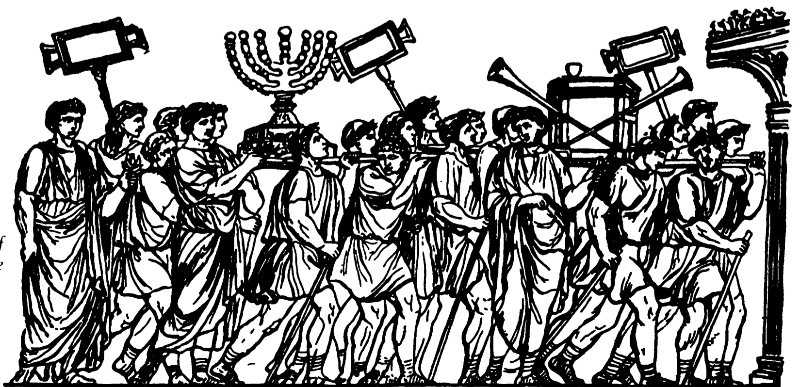
A drawing of a bas-relief showing the Looting of the Temple