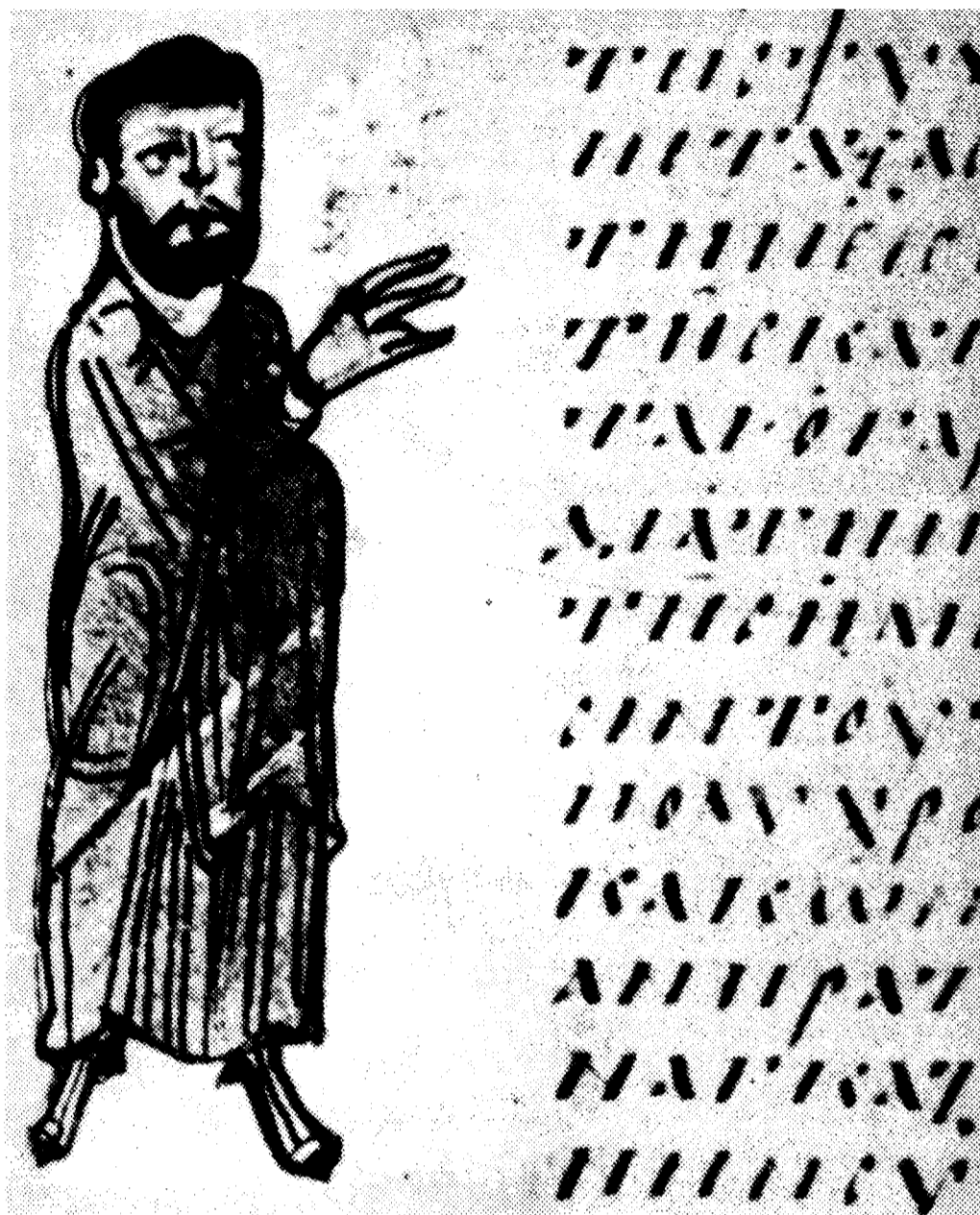
Philo Judaeus, as depicted in a ninth-century manuscript

To achieve his goal, Philo outlined the process of individual spiritual perfection that each soul must pass through in order to become, like Philo, a "citizen of this whole world." The uplifting of the souls of the masses from beastlike to godlike was the the passionate commitment of Philo. As a model, Philo suggested that men take as their ideal the concept of "becoming like unto God."